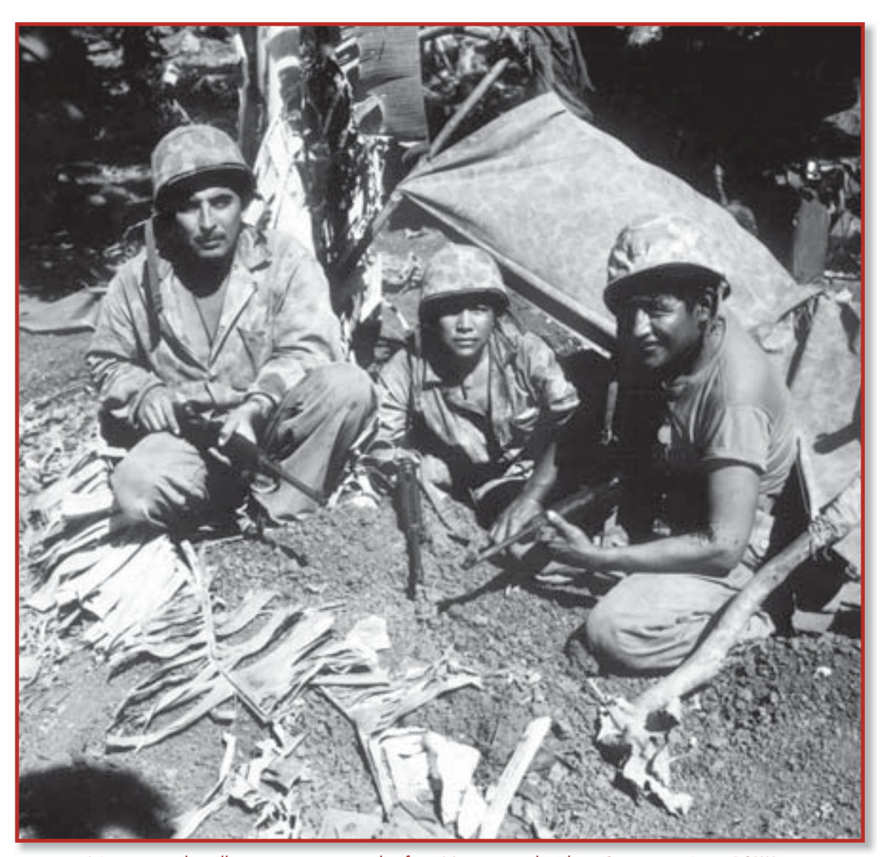
Navajo code talkers were among the first Marines to land on Saipan in June 1944.

Elk • Ma-e Ah-tad • Girl • Lin • Horse • Tkin • Ice • Klizzie-yazzie • Kid • Ah-jad • Leg • Na-as-tso-si •