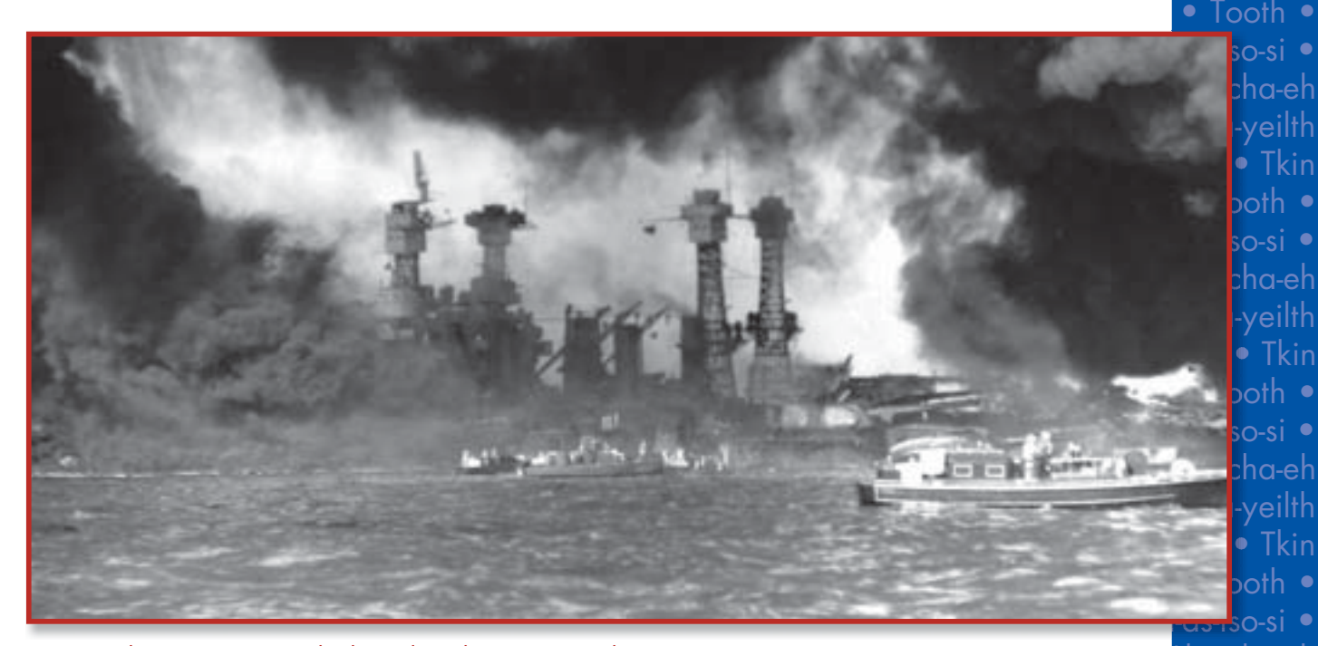
The Japanese attacked Pearl Harbor on December 7, 1941.

Victory depended upon the ability to quickly communicate battle plans and other important information over long distances.