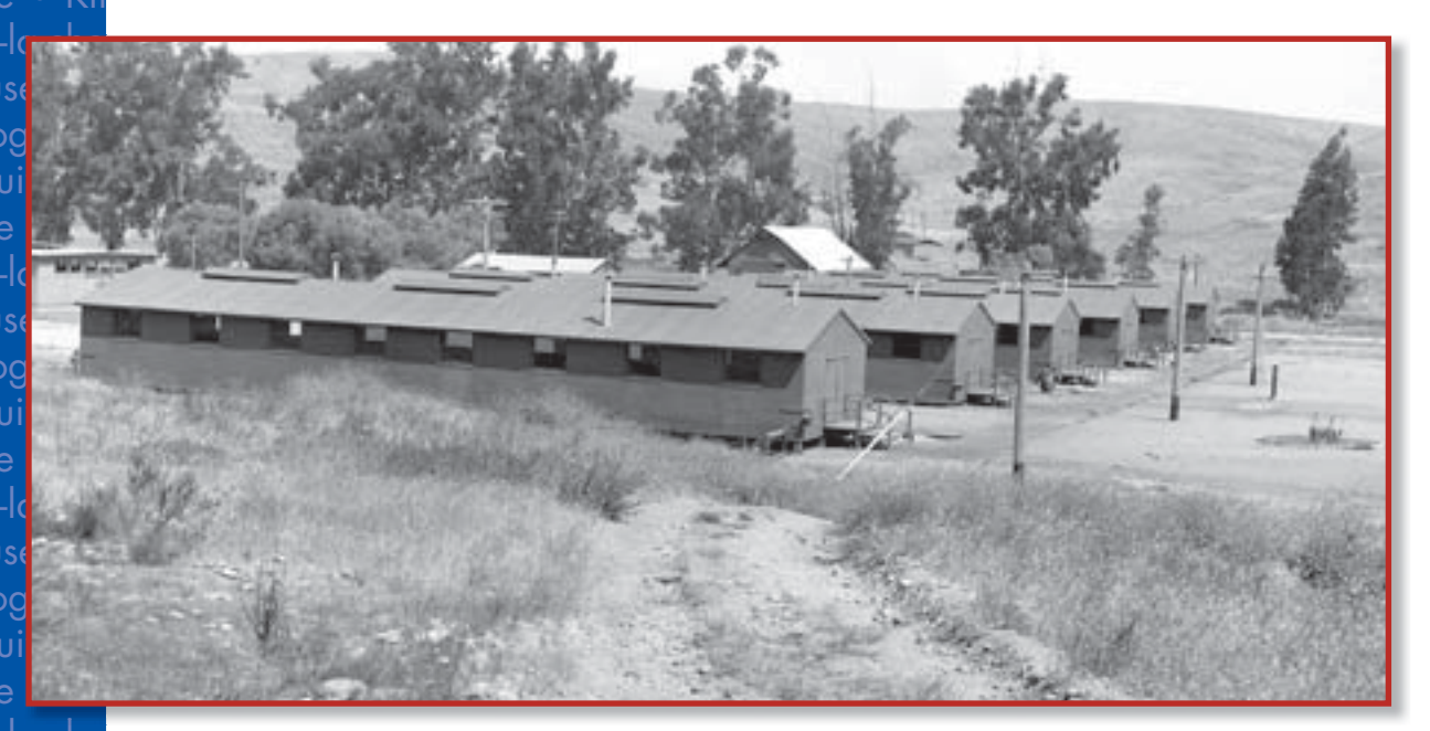
New recruits stayed in barracks like these at Camp Elliott.

The Navajo code project was top secret, so the Navajos didn't know they were signing up to be code talkers. They knew only that they were joining the Marines and helping to defend the United States.